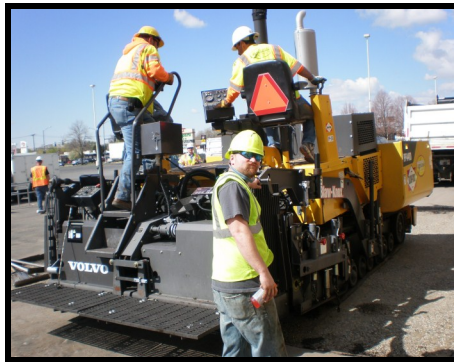
Top: Griz and Kiko Right: Paving Crew at Sear's - Billings, MT